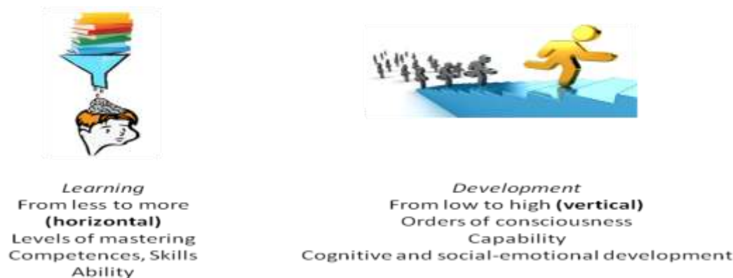
Fig. 1 Horizontal learning vs. vertical adult development

The most fundamental distinction we propose to adopt for discussions of shared leadership is the one between “learning” and “development” (Laske 1999), shown in Fig. 1.